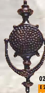
02 1032 E 24 w = 8 cm h = 20 cm w = 360 gr