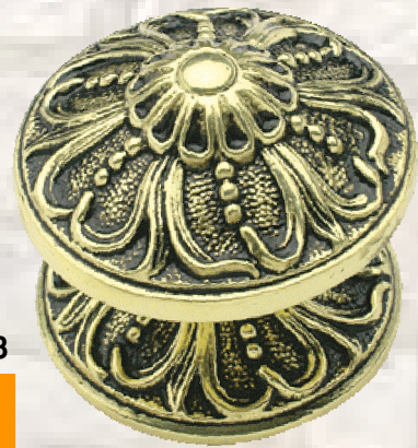
02 1013 A 30 Ø = 9 cm w = 510 gr