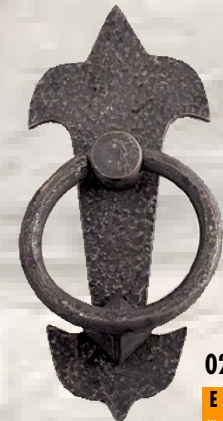
02 1036 E 28 w = 7 cm h = 17 cm w = 310 gr