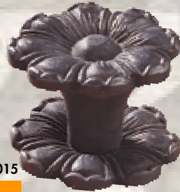
02 1015 A 32 Ø = 8 cm w = 485 gr