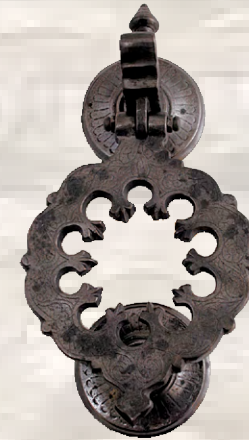
02 1024 E 10 w = 14 cm h = 20 cm w = 1390 gr