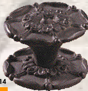
02 1014 A 31 Ø = 8 cm w = 460 gr