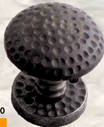
02 1020 B 42 Ø = 5 cm w = 225 gr