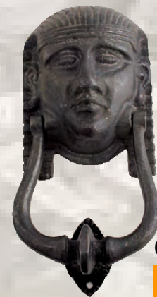
02 1026 E 21 w = 8 cm h = 12 cm w = 810 gr