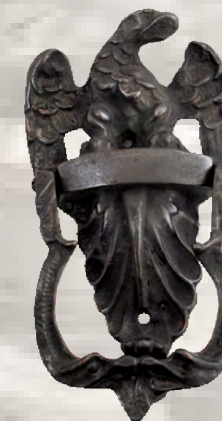
02 1027 E 22 w = 10 cm h = 18 cm w = 810 gr