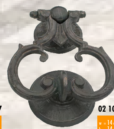
02 1038 w = 14 cm h = 14 cm w = 765 gr