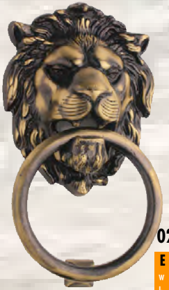
02 1025 E 11 w = 11 cm h = 14 cm w = 785 gr