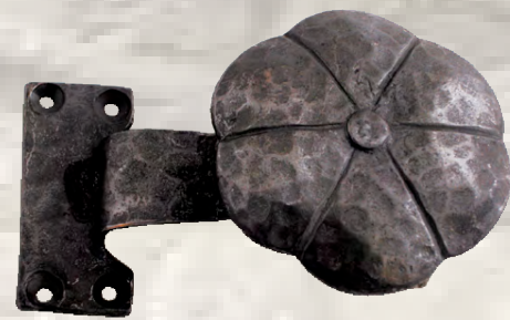
02 1021 B 31 Ø = 3 cm w = 235 gr