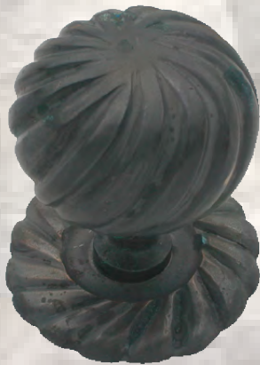
02 1018 Ø = 8 cm w = 585 gr