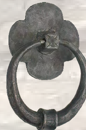
02 1037 w = 9 cm h = 14 cm w = 510 gr