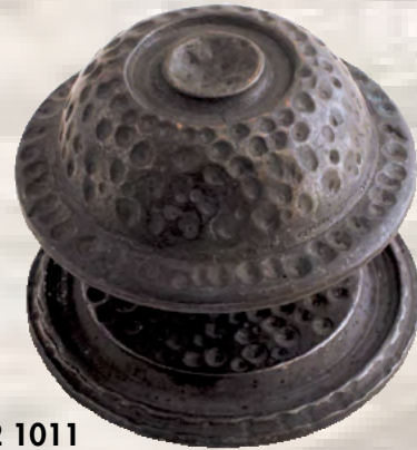
02 1011 B 19 Ø = 8 cm w = 480 gr