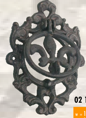
02 1034 w = 12 cm h = 16 cm w = 485 gr