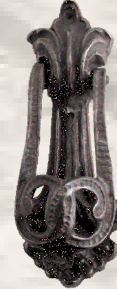
02 1028 E 23 w = 7 cm h = 20 cm w = 830 gr