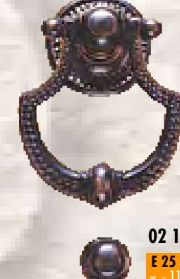
02 1033 E 25 w = 11 cm h = 13 cm w = 770 gr