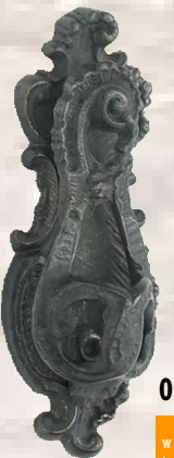
02 1030 w = 8 cm h = 20 cm w = 690 gr