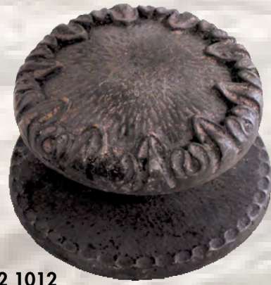
02 1012 B 21 Ø = 12 cm w = 425 gr