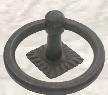
02 1039 Ø = 11 cm w = 560 gr