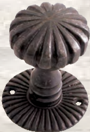
02 1019 B 17 Ø = 5 cm w = 205 gr