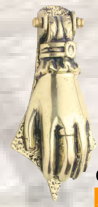
02 1029 B 18 w = 8 cm h = 18 cm w = 680 gr