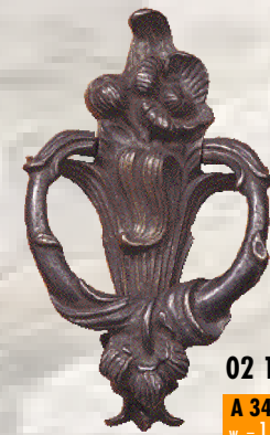
02 1031 A 34 w = 11 cm h = 19 cm w = 840 gr