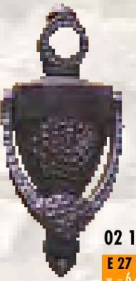
02 1035 E 27 w = 6 cm h = 13 cm w = 225 gr