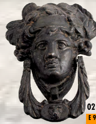
02 1022 E 9 w = 14 cm h = 18 cm w = 1315 gr