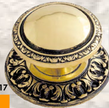
02 1017 B 23 Ø = 8 cm w = 335 gr