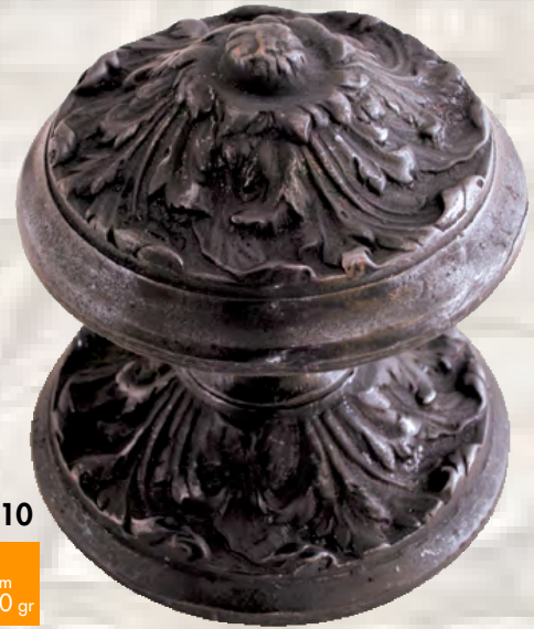
02 1010 B 20 Ø = 12 cm w = 1190 gr