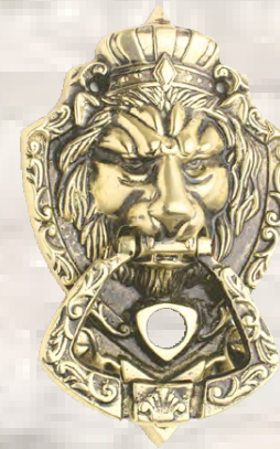
02 1023 E 31 w = 11 cm h = 16 cm w = 455 gr